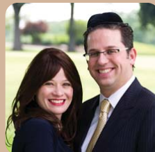
Benjy & Bashi Fish Young Leadership Award