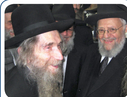
Rav Binyamin, zt"l with Rav Aharon Leib Shteinman, zt"l